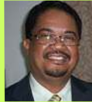
Honourable Gregory Rusland, Minister of Natural Resources

“The Caribbean Community Secretariat through the Energy Programme should play a facilitating role in the area of energy as far as the structure is concerned. . .It must not try to re-invent the wheel, but try to make use of the expertise that exists in the Region, in Suriname, in Trinidad and other parts of the Region. Try also to make use of those structures in order to support the countries that are in lesser position - the smaller nations so that they also have the developments that they need.”