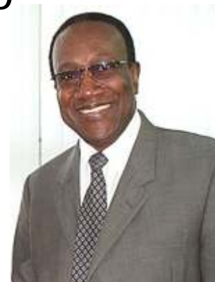
H.E. Dr. Edwin Carrington, Secretary-General Caribbean Community

One key task that is being pursued under the Energy Programme is the finalisation and implementation of the CARICOM Energy Policy which is currently in draft. This was developed by the Task Force on Energy in 2007 and while it was accepted by the Conference of Heads of Government as having met the prescribed Terms of Reference, the Leaders mandated that further work should be done with respect to the structure of energy pricing in the Region to better inform the Policy. It is hoped that this task will be completed shortly.