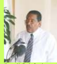
Honourable Charles Savarin, Minister of Ports, Environment, Energy

“The Secretariat needs to develop the capacity to provide technical support. This may be in terms of legal analyses of contracts, proposals, interpretation of existing laws, regulations and other items that arise. . . . Communication, I think, is a key factor. I believe that all participating member countries can be kept abreast and encouraged to make the inputs to keep the Secretariat informed and abreast of developments. If I want to know what was the cost of electricity say for instance in any CARICOM Member State I should be able to send an email, pick up the telephone and call the Energy Unit and they should be able to tell me.”