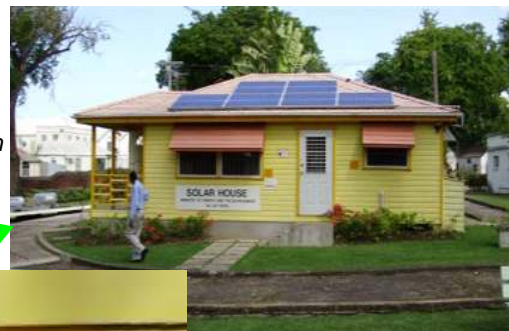
The Solar House in Barbados which is an initiative of the Government of Barbados

Do you know that all your domestic energy needs could be satisfied through renewable energy? A visit to the Solar house in Barbados will leave you with no doubt about the possibilities of solar power. This two bedroom one bathroom chattel house built in 2007 has twenty (20) roof-mounted 100-Watt photovoltaic (PV) panels with battery backup system designed to provide an average of 60 kWh (units) of electricity per month. In addition to lighting some of the appliances powered are a fridge, microwave, electric kettle, computer, four ceiling fans, an electric iron, a standing fan and an evapo-cooler, TV, DVD and radio. Locally-manufactured solar water heaters provide hot water.