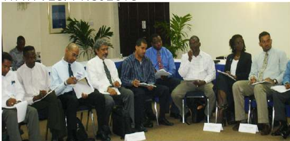
Focal Points and Regional Organization representatives at CARICOM CREDP/GTZ Phase II Operations Planning Meeting and Collaboration with OAS' Caribbean Sustainable Energy Project (C-SEP) held in October 2008.

This Energy Newsletter will serve as one means of keeping various actors in the Regional Energy Sector aware of developments under the Programme and in the Region. It will also allow for feedback. Please permit me to use this opportunity to encourage everyone in the regional energy sector to maintain active participation and co-operation towards a harmonized approach to maximizing the contribution of this sector to the Community's development.