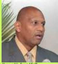
Honourable Conrad Enill – Minister of Energy and Energy Industries

Minister Conrad Enill, Trinidad & Tobago