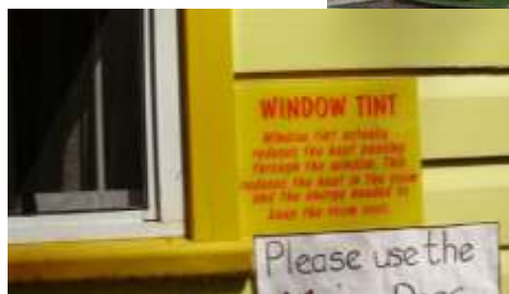
The windows are designed with awning to provide protection from direct sunlight.